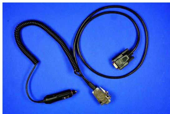
Power supply adapter p/n VR00650-00-0601